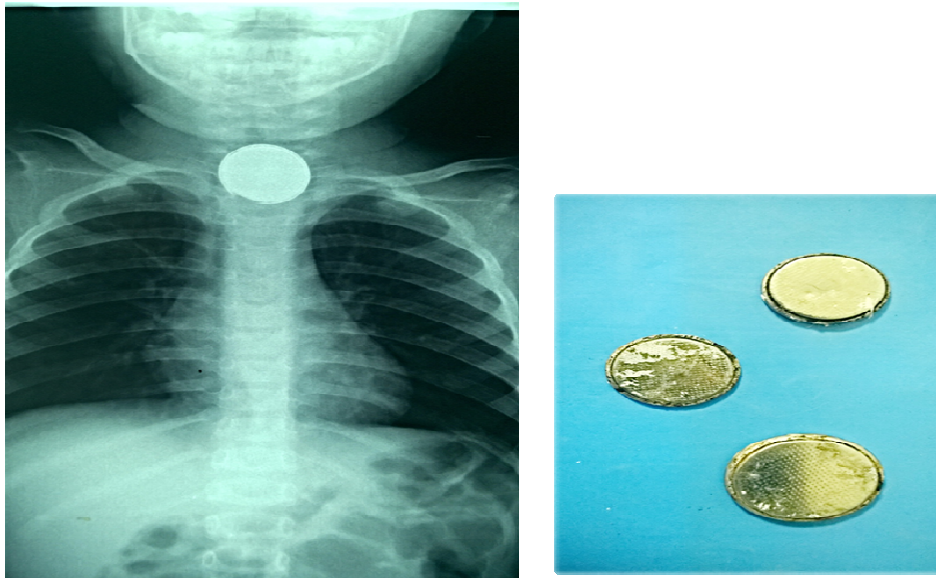
Fig 1: Girl 03 years, admitted to ingestion of button battery lasting for 1 month. Esophageal stenosis on the battery. Treatment was an esophageal-coloplasty.

Intestinal Location: The risks are low. In the absence of symptoms and signs of fragmentation of the stack, a simple clinical and radiographic monitoring was proposed by Laugel V. et al. [1] Laxative therapy may be helpful. When opening the battery, or to ulceration of clinical signs, surgery remains the only recourse. In our practice all intestinal localizations were made without waiting for signs of complications.