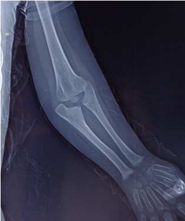
Fig. 2 : Radiographie montre la présence de 02 ulnas, 07 Métacarpiens et absence totale du