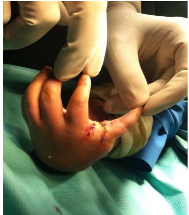
Fig. 4: Resection of the 7th finger and the pollicization of the 6th finger